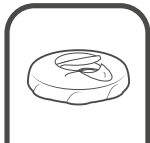
Base Lid and Steam/Pouring Steam Vent